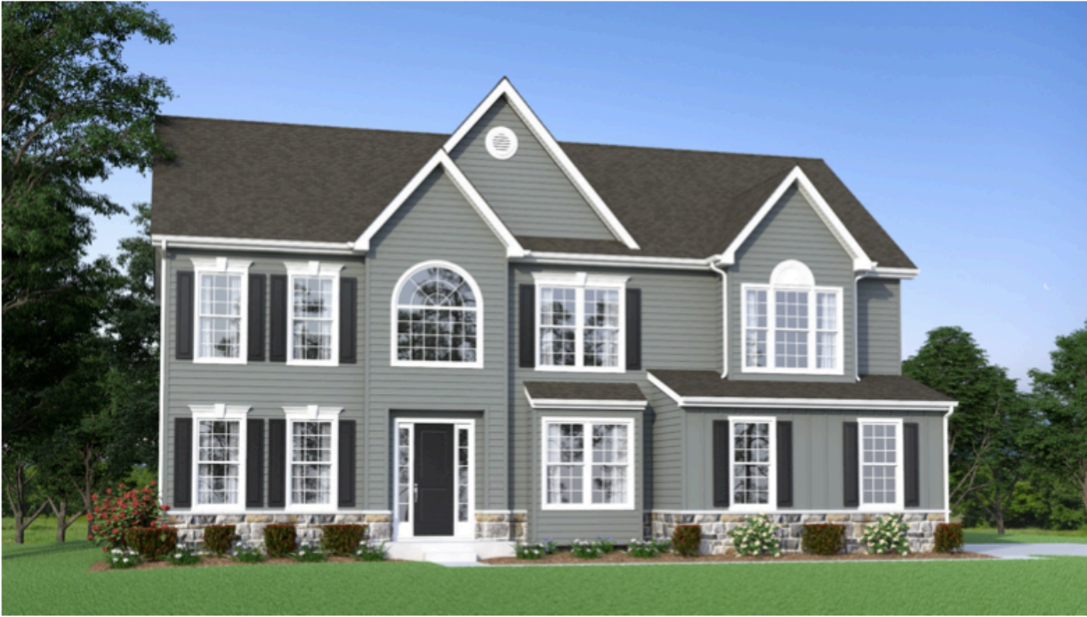
Elevation A - American Classic