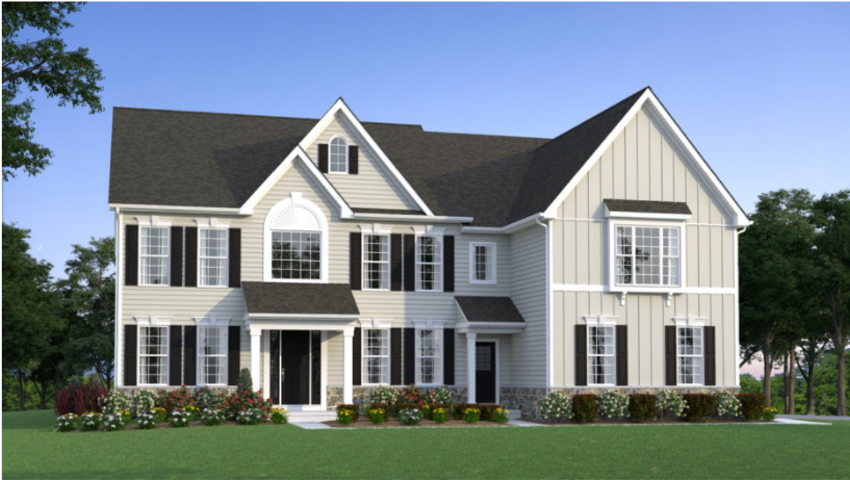
Elevation A - American Classic