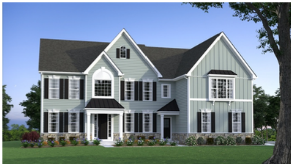
Elevation B - French Country