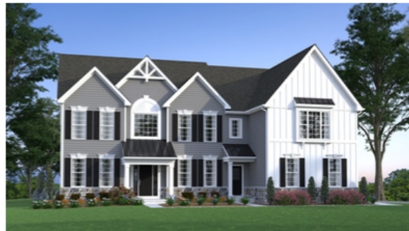
Elevation C - English Manor